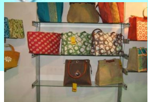
Jute product promoted in a trade fair