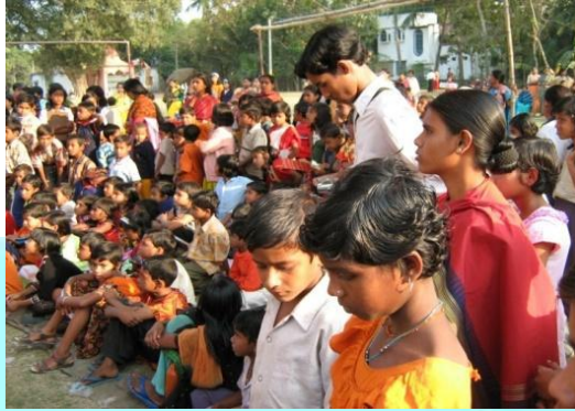
Annual sports for children