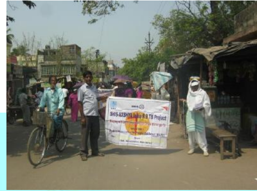
Children in puppet show