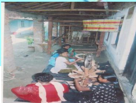
Women folk busy in "Charkha"