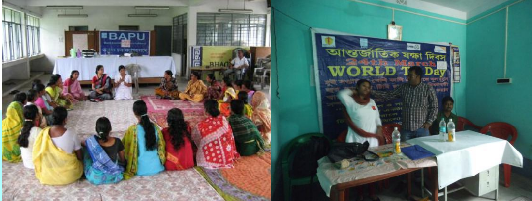
Meeting with CBOs